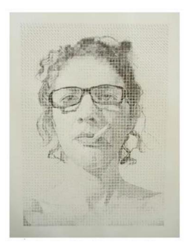
In 'Self-Portrait à la Chuck Close, Jena Sibille effectively uses the grid structure of artist, Chuck Close.