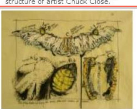
Cecilia Kane's "Helping Hand Wings for Hazel" provides instructions for makeshift wings to ease a loved one's fear of dying.